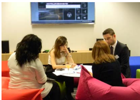
Young Expert Panel on Person-centred Care, Brussels 2014.