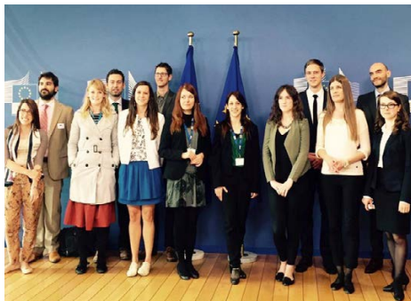
Young Forum Gastein Scholars with European Commission trainees' Health Affairs Sub-committee at the so-called “Political Hour” meeting with Commissioner Andriukaitis' cabinet, Brussels 2015.

In addition the Young Forum Gastein has started increasing its activities during the year outside the EHFG conference, with Network members meeting up at international conferences and summer schools, and participating in specially organised workshops hosted by the European Commission and other partners, as well as utilising social media such as Facebook, Twitter, LinkedIn, the Young Forum Gastein Members Website, and technology such as webinars and skype conferences to keep in touch and help implement a new strategy for Young Forum Gastein for “2016 and beyond”.